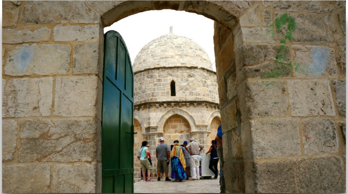
The Chapel Of The Ascension

Jesus himself is the way to heaven, and so it is fitting that he should reign from there. Hebrews (7:25) tells us that in heaven Jesus intercedes for us always and appears before God on our behalf (9:24). But being at God’s right hand does not